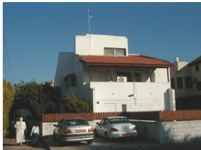
Please pray for us!

IN THE GHETTOS, COLUMNS OF JEWS WOULD APPROACH HIM FOR EVALUATION- HIS SWAGGER STICK INDICATED HIS SELECTION. TO THE RIGHT, LABOR CAMP... TO THE LEFT, DEATH.